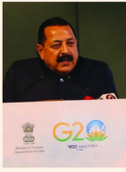
Union Minister Jitendra Singh addressing the delegates from G20 countries at a side event on 'Film Tourism for Economic and Cultural Preservation'.

“This change has happened. Common people on the streets of Srinagar want to move on. They have lost two generations (due to militancy),” the