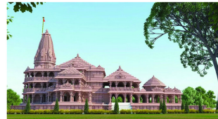
The Ram Mandir under construction in Ayodhya.

“The Trust has taken the decision that the first phase of the Ram Temple should be completed by December 30, 2023. In the first phase, the five ‘mandaps’ on the ground floor, out of which the most prominent