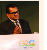
India's G20 Sherpa Amitabh Kant speaking at the event.

“Kashmir is not just a destination but a unique experience. Kashmir is an amazing destination because of Alpine forests, streams etc. There is no better destination than Kashmir as it has