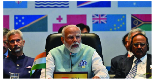
Prime Minister Narendra Modi addressing the summit.

The summit was co-chaired by Prime Minister Modi along with his counterpart from Papua New