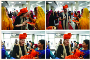
Flight at the Srinagar international airport in the morning amidst tight security.

Officials said the delegates from several countries of the G20 grouping arrived in a chartered