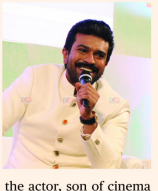
Actor Ram Charan speaking at the 'Film Tourism for Economic and Cultural Preservation' event.

“It will sound cliché, but the coolest place to shoot in India is Kashmir. I am a second generation actor. My dad has shot extensively in Kashmir,”