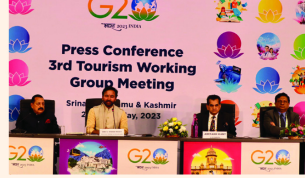
Press Conference 3rd Tourism Working Group Meeting, Srinagar, Jammu & Kashmir, May 22, 2023.

“We are going to soon declare national tourism policy for India. We are planning global tourism investment summit,” Reddy, the minister for Culture and Tourism, said. He said the Centre is