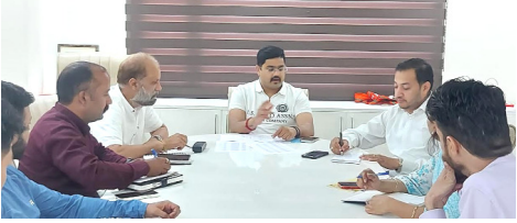
JJ NEWS SERVICE

JAMMU, MAY 21: In view of upcoming month-long campaign from May 30 to June 30 in connection with successful completion of nine years of BJP Government at the Centre, Social Media Department of Bharatiya Janata Party, Jammu and Kashmir will play its vital role in publicizing the schemes and key-achievements of Modi Government and bringing awareness about the same amongst the general public through social media platforms.