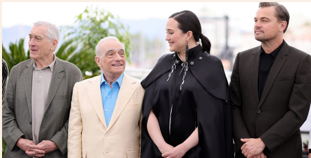
As per 'Variety', De Niro drew parallels between his character and Donald Trump, whose name the actor initially refused to say out loud at the press conference. "That guy is stupid," he said of the former president. Lily Gladstone, who stars as Osage tribe member Mollie Burkhardt, pointed out that Osage members still attended the funeral of William Hale, in denial about his involvement in the brutal murders of tribe members.

De Niro admitted that he struggled to connect with William Hale, saying: "I don't understand a lot about my character. Part of him is sincere. The other part, where he's betraying (the Osage tribe), there's a feeling of entitlement. We became a lot more aware (of that dichotomy) after George Floyd with systemic racism."