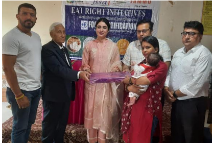
JI NEWS SERVICE

JAMMU, MAY 18: In alignment with the Honourable Prime Minister Shri Narendra Modi's vision for Food Fortification to reduce malnutrition, Jammu Smart City Ltd has organized a workshop cum demonstration on Food Fortification, which is a scientifically proven, cost-effective, scalable, and sustainable global intervention that addresses the issue of micronutrient deficiencies.