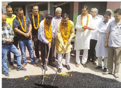
J I NEWS SERVICE