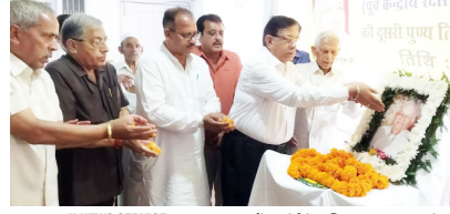
J I NEWS SERVICE

JAMMU, MAY 18: Jammu Central Mahajan Sabha, today paid rich tribute to Late Prof. Chaman Lal Gupta, a son of the soil of Jammu and Kashmir Union Territory, who was the Chief Patron of the Jammu Central Mahajan Sabhan and also being a popular and visionary leader of the masses, had devoted his whole life for the betterment of the society. He was MLA, MP and Union Minister and played a vital role in politics in Bhartiya Janta Party (BJP). He was a man of strong will and of undeterred courage who faced many odd situations in his whole political life. In the year 1990, when the militancy was at its peak in Jammu and Kashmir and Kashmiri pandits were forced to leave the valley in burning situation Prof. Chaman Lal Gupta joining the "Ekta Yatra", courageously hoisted National Flag at Lal Chowk in Srinagar. He never compromised on his political ideology till he breathed his last. He remained a dedicated soldier of RSS with which he was associated from his student life and after