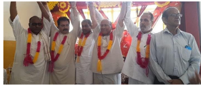
JI NEWS SERVICE