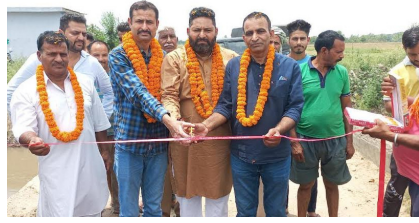
Sarpanch, Naib Sarpanch, Panches and Public of Panchayat.