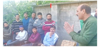
J I NEWS SERVICE

ASKS OFFICERS FOR MOTIVATING FARMING COMMUNITY TO ADOPT PROPOSED INTERVENTIONS IN THE APPROVED PROJECTS UNDER HADP