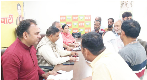
J I NEWS SERVICE