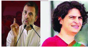
BENGALURU, MAY 10

Former Congress President Rahul Gandhi on Wednesday appealed to the people of Karnataka to vote in large numbers to build a 40-per cent commission-free state. "Karnataka's vote... for 5 guarantees, for women's rights, for youth employment, for the upliftment of the poor. Come, vote in large numbers." "Let's build a 40% commission-free, progressive Karnataka together," Gandhi tweeted in Hindi. Congress President Mallikarjun Kharge said the people of Karnataka have decided to choose a progressive, transparent and welfare-oriented government. He also welcomed first-time voters to participate in this democratic process for a better future. "People of Karnataka have decided to choose a progressive, transparent and welfare-oriented gov-