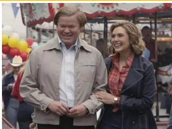
the weight of essaying a real person is apparent but an actor