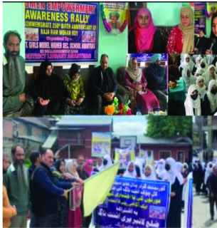
JN NEWS SERVICE ANANTNAG, MAY 9

On the 250th Birth Anniversary of Raja Ram Mohan Roy, a rally and a seminar on women empowerment was organised today by Raja Ram Mohan Roy Library Foundation (RRLF) in collaboration with District Library Anantnag & Govt. Girls Higher Secondary School Lal Chowk Anantnag.