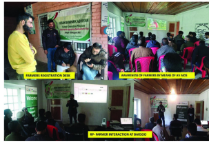
JN NEWS SERVICE GANDERBAL, MAY 9

The Kisan Sampark Abhiyan (Farmers Orientation) under Holistic Agriculture Development Programme (HADD) continued at the three venues across three blocks of district Ganderbal. The HADD is aimed at pushing the agriculture and allied sectors to a new trajectory of growth with economy, ecology and equity as its guiding pillars.