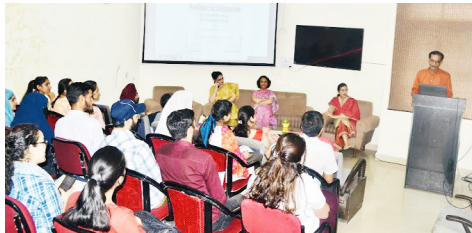
J I NEWS SERVICE