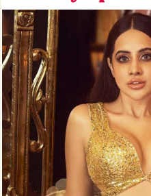
Uorfi Javed has spoken about an incident when she was uninvited from an event in Mumbai 'at the last moment' as she was not on actor Madhuri Dixit's guest list. Taking to Twitter on Sunday night, Uorfi shared a post and explained what happened. She didn't caption the post but added an emoji. Uorfi shared a screenshot of

Madhuri Dixit from a paparazzo's Instagram account. She wrote, "Fun fact about this event - they reached out to my team inviting me, I accepted the invitation, cancelled my plans, arranged my outfit, last moment they told me, team that I'm no more invited." She added, "When we asked them the reason they said I'm not on Madhuri's guest list (what a weird reason). Bhai mai mar nahi rahi kahi jaane k liye (I am not dying to go anywhere) but to tell someone not to come last moment after inviting them. Grow some balls or borrow from me!" In her next tweet, Uorfi spoke about actor Kangana Ranaut. She wrote, "I'm slowly and slowly understanding why Kangana behaves the way she does. When you've been ganged up against for so long, you go hard! You go queen (face savouring delicious food and crying emojis) @KanganaTeam." Reacting to the incident, a person wrote, "You are absolutely right! I support you both gorgeous girls." Another fan said, "Stay strong ma'am." A comment read, "You also go, queen." "Come on Uorfi. You are on my guest list," said a Twitter user. "That's called maturity with experience! She's the most misunderstood actress. More power to you," commented another person. ssUorfi rose to fame after featuring in Bigg Boss OTT in 2021.