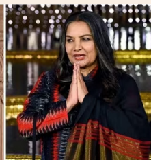
constitutional authority." Reacting to her tweet, Kangana wrote, "This is a very valid point except for the

fact that no one asked for a ban on LSC people just didn't want to see it for many reasons, major reason was it was a remake of a very popular old Hollywood classic which most people had already seen..." While some are seeking a ban on the film, a few also demanded tax exemptions in BJP-ruled states. On Sunday, Information and Broadcasting Minister Anurag Thakur lashed out at the opposition parties and said those who are opposing The Kerala Story film are supporters of the proscribed PFI and terror outfit ISIS. "The Kerala Story is not just a film. There are some people who want to lure girls into the path of terrorism, and their face has been exposed in this film. Some political parties are opposing it.