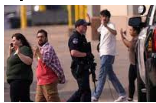
Dallas, CNN cited The Dallas Morning News report.