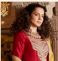
Chadda. Once a film has been passed by the Central Board of Film Certification nobody has the right to become an extra

Kangana Ranaut took to Twitter on Monday to show her support for Shabana Azmi who tweeted about the controversial film The Kerala Story. Shabana had questioned those who were demanding a ban on the film. It claims to be based on a dangerous conspiracy that has been hatched against India as part of which several young girls from Kerala were made to join the terror outfit ISIS. After The Kerala Story was pulled down from theatres in Tamil Nadu on Sunday amid threats, Shabana said it was as wrong as asking for a ban on Laal Singh Chadda, which starred Amir Khan in the lead. The veteran actor tweeted, "Those who speak of banning #TheKeralaStory are as wrong as those who wanted to ban Amir Khan's #LaalSingh