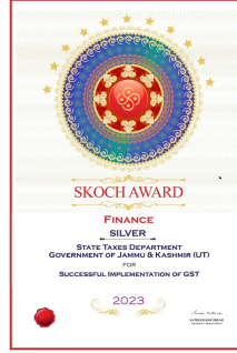
SKOCH AWARD 2023 FINANCE SILVER STATE TAXES DEPARTMENT GOVERNMENT OF JAMMU & KASHMIR (UT) SUCCESSFUL IMPLEMENTATION OF GST

This year, the Skoch Awards recognized several noteworthy initiatives, including those aimed at strengthening healthcare infrastructure, promoting financial inclusion, empowering women, enhancing digital literacy, and