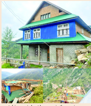
ment drive carried out by revenue department.

Earlier, the State land encroached by the accused was retrieved by the District administration in the anti encroach-