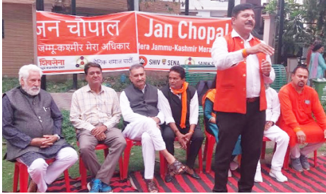
JI NEWS SERVICE

JAMMU, MAY 02: Shiv Sena (UBT) and Sainik Samaj Party today jointly launched the campaign "Mera Jammu-Kashmir Mera Adikar" while organizing a first of its kind "Jan-Chopal" in Jammu to highlight the grievances of the people and to express their aspirations, vowing of fulfillment of people's aspirations. The campaign was started by organising first of its kind "Jan Chopal" in the