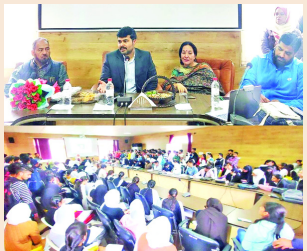
ated through the online mode. In his address, the Deputy Commissioner explained in detail the historical aspect of UPSC, scheme and scope of Civil Service examination and strategies to be adopted for qualifying this prestigious examination. The Chief Guest shared his own preparation and success journey and the

Around 200 students of different semesters participated in the Seminar organised in the College Conference Hall, while over 300 students partici-