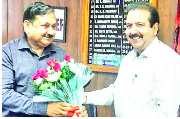
After assuming the office, the Director held an introductory meeting with the officers, officials and other staff members of the Directorate wherein he was