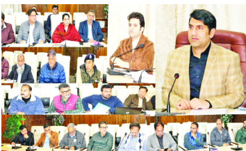
plantation at various important locations including flyovers etc. The meeting also kept Rs 1.50 crore and Rs 1.0 crore for landscaping/development of lawns, walking spaces, pavements and plantation at Government Medical College (GMC) and Sher-i-Kashmir Institute of Medical Sciences (SKIMS), Soura respectively. The meeting further kept Rs 4 crore for earthen shoulders along the urban roads. While Rs 2.0 crore were also earmarked for implementation of Mission Life Actions.

In addition, Rs 5.0 crores were allocated for vertical