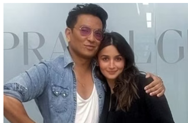
seemingly for Alia.

Meanwhile, Prabal also teased fans with sneak peak of an outfit,