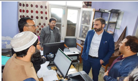
Husbandry, RDD, Forest and Housing & Urban Development Departments.