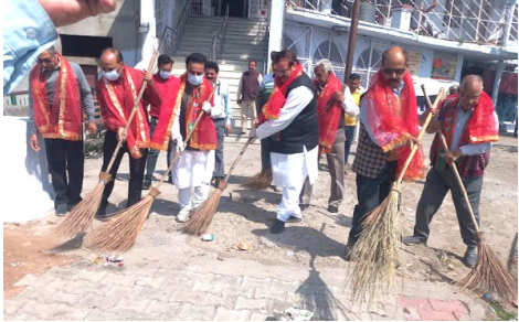
JJ NEWS SERVICE

JAMMU, MAR 27: In continuation with its Swachh Bharat Abhiyaan program, BJP Swachh Bharat team launched its cleanliness drive during Navratras at Maha Maya Mata Temple. A large number of volunteers of BJP Swachh Bharat Abhiyaan cleaned the premises of the Maha Maya Mata temple. The drive was led by Er Dil