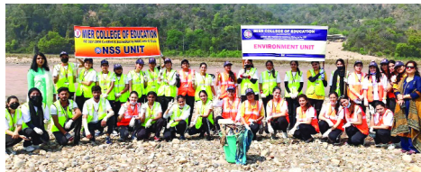
JJ NEWS SERVICE

JAMMU, MAR 23: The Environment Unit of MIER College of Education in collaboration with the NSS Unit celebrated "World Water Day" by organizing the "Clean Tawi Campaign" at the banks of the Tawriver in Jammu city. The theme for World Water Day 2023 was "Accelerating the Change to Solve the Water and Sanitation Crisis", which is in line with the targets of UN Sustainable