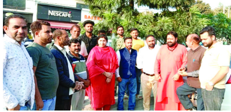
JJ NEWS SERVICE

URGES TO FOCUS ON LESSONS EMBEDDED IN HOLY FASTING