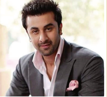
latest outing, Tu Jhoothi Main Makkaar. The film released on March 8 and also starred Shraddha Kapoor.

ego. I don't have self-respect also. I am very happy saying sorry even if I am in the right or wrong but I like that space. I like the concept of space." Ranbir married Alia last year in April. They welcomed their daughter Raha Kapoor in November 2022. They recently celebrated their first Holi as husband and wife, and as parents. Ranbir Kapoor is currently basking in the success of his