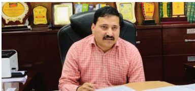
and evening shifts. The CEO Kathua MC further informed that proper signages

At the outset, the DC was apprised by CEO Kathua MC that proper sweeping has been provisioned under which a dedicated team will ensure sweeping at New Bus Stand in morning