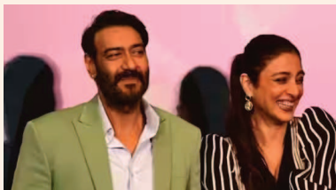
ship in which they can be comfortable around one another and even curse each other out. Ajay and Tabu first acted together in Vijaypath (1994), which was her breakthrough hit in the industry. Tabu's first film as a leading lady was with

A ctor Ajay Devgn shared that he has known Tabu since they were teenagers. He added that they both share a longtime equation of 'yaari aur gaali-galauch wala'. In his upcoming film, Bholaa, Ajay Devgn will once again share the screen with Tabu. However, this time, the actor is directing his good friend. Tabu and Ajay have worked together on numerous hits, the last being Drishyam 2 (2022). The actor recently revealed that they have known each other since they were teenagers and share a friend-