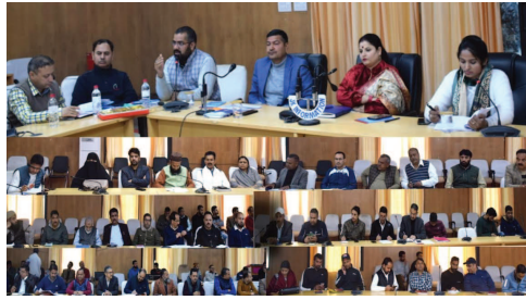
PRIs plan for the FY 2022-23.

The chairperson reviewed the sector wise physical and financial status of the works taken up under District Capex, Area Development Plan & DDC, BDC and