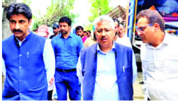
SDM Pahalgam and other civil and police officers were also present on the occasion. At Chandanwari camp, ACS reviewed the healthcare facilities