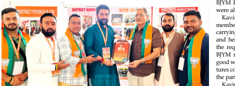
JJ NEWS SERVICE

'BJYM'S APPROACH HOLISTIC, PEOPLE CENTRIC'