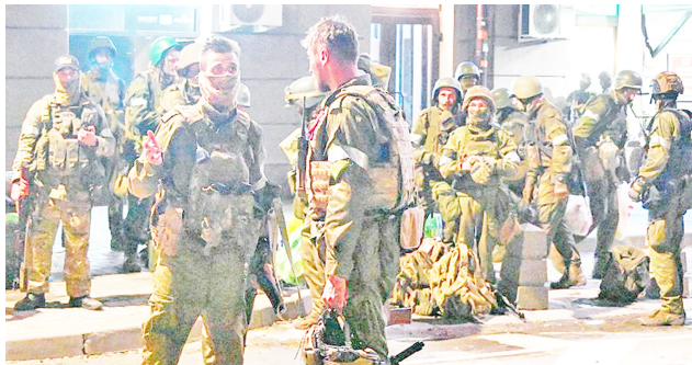
take stock of what has gone wrong for the regular Russian forces.

Notwithstanding the pretext of the US-led NATO's support to Ukraine, 16 months are a long enough period to