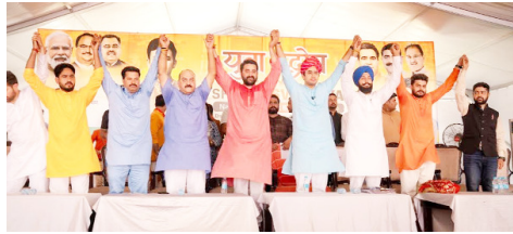
J I NEWS SERVICE

JAMMU, JUNE 27: As India marks nine years of Prime Minister Narendra Modi's government, 'Seva, Sushan and Garib Kalyan' has been the cornerstone of the BJP government which has led to upliftment of crores of people across India. This was stated by Bharatiya Janata Yuva Morcha (BJYM) national president and MP Tejasvi Surya who is on two day visit to Jammu and Kashmir.