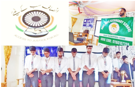
destroyed thousands of individuals and their families. He requested everyone that three things are needed to fight drug abuse and they are awareness, motivation and will power. He also threw light on various laws related to drug abuse. He said anyone involved in drugs shall face tough legal conse-