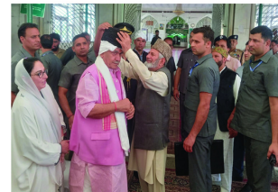
JNEWS SERVICE SRINAGAR, JUNE 27