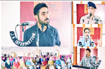
it is an important part followed by administrations are doing their work however, we all as society have to play the role and save our youth.