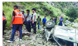
JNEWS SERVICE DODA, RAMBAN, JUN 27

Two siblings among seven people were killed while 12 people were injured in twin road accidents in Doda and Ramban districts of Jammu on Tuesday, officials said. Officials told news agency, that two vehicles skidded off the road and plunged into deep gorges at Guidanda in Doda and Rampara in Ramban.