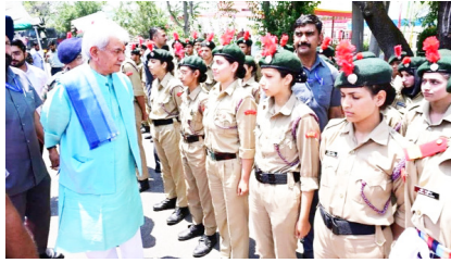
JI NEWS SERVICE

SRINAGAR, JUNE 27: NCC Special National Integration Camp 2023 concluded today at JAKLI Regimental Centre, Srinagar. The SNIC was organised under aegis of NCC