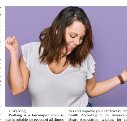
that is suitable for people of all fitness levels. It is a great way to burn calo-

Here are 5 low-intensity aerobic exercises that can help you achieve your weight loss goals: