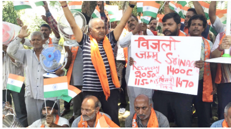
JI NEWS SERVICE

JAMMU, JUN 16: As per the schedule Jammu shall witness 2 hour long power cuts in urban areas and even longer power cuts in rural areas. He said that unsheduled power cuts are much more than the scheduled power cuts. The workers of DOGRA FRONT & SHIV SENA