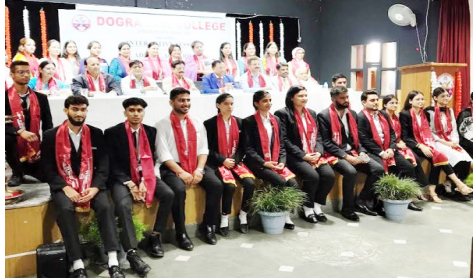
JI NEWS SERVICE