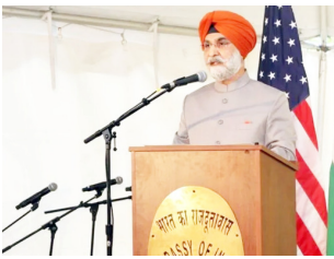
India. Even as I speak, NSA Jake Sullivan is in New Delhi," he said.