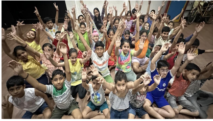
JJ NEWS SERVICE