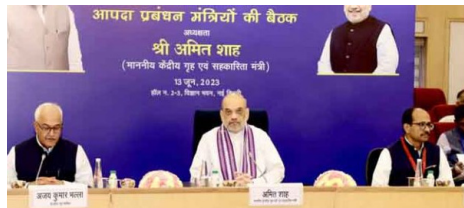
Shah said during COVID-19 pandemic, under the leadership of PM Modi, along with the chief ministers of the states, the country successfully faced the worst epidemic of the century.

"All of us together, under the leadership of Prime Minister Narendra Modi, all the chief ministers are working on the ground. We will have to work more and