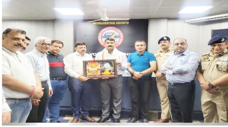
J I NEWS SERVICE