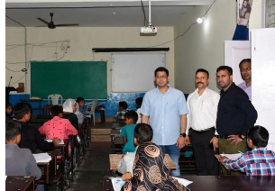
Deputy Commissioner Rajouri inspects examination centre for EMR admission Test.

The EMRs is being conducted as per the previous year practice and this year only one centre with three sub-centres, was set up at Government Degree