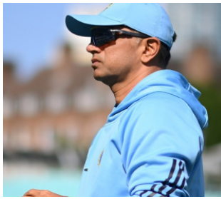
Dravid said the team was confident of chasing down a 300-plus target in the fourth innings.

"We thought that it was a great decision when Australia were at 70/3 and then we leaked a lot of runs in the next two sessions. Even if we would have gotten them out by 300, we would have been in the game. We could have had a chance in the fourth