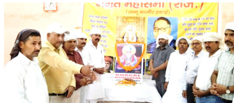
JJ NEWS SERVICE

JAMMU, JUN 11: In which followers/devotees of Sant Kabir from different parts of Tawi Island villages participated and paid homage to the Great Saint of Bhakti movement. The programme started