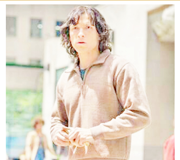
rather sad drama in the middle, before fully embracing the sappy sentimentality at its core towards the end.

That opening sequence, elaborately staged in an extended single shot by director Kornél Mundruczó ( Pieces of a Woman ), suggests that you're in for a thriller, but The Crowded Room evolves into a