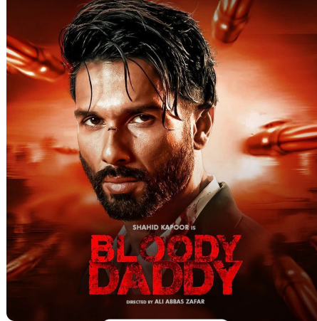
SHAHID KAPOOR IS BLOODY DADDY DIRECTED BY ALI ABBAS ZAFAR