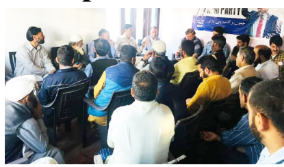
JI NEWS SERVICE