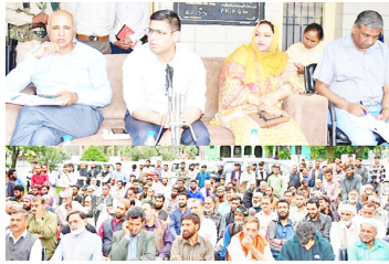
During the public outreach camp, the officers of different departments also took the opportunity to educate the locals about the government schemes and programs and urged them to take advantage of these initiatives. The Deputy Commissioner sought active cooperation from the general public in achieving the developmental goals and called for coordination among departments and PRIs. He also urged the youth to avail themselves of the various self-employment schemes launched by the government to become self-reliant.

The camp witnessed a good turnout, with people from various parts of the block coming forward to voice their concerns. The issues raised by the locals included the macadamization of roads, up-gradation of schools, meeting payroll of staff in Government institu-