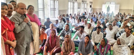
J I NEWS SERVICE

JAMMU, JUN 7: Senior Congress leader and former Deputy Chief Minister Tara Chand said that Jammu suffered a lot under present regime and asked people to question BJP the achievements after abolition of special status, down grading of the state and our rights to land and Jobs. Addressing a monthly meeting of party delegates in Aijal Malal of Chhamb Constituency today Tara Chand said that people of Jammu region especially the youth feel betrayed by the BJP and the state lost its status, dignity and identity apart from the right to land and jobs guaranteed since maharaja time. The BJP played with the sentiments of the people, who voted them to power.