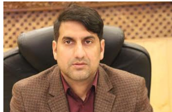
the young generation about the harmful and deadly effects of the drugs. They also raised awareness about ill effects of tobacco products and mobilized public opinion to set up tobacco free zones at public places in

The participants through skits, nukkad natak and other cultural programmes to educate