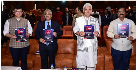
outlines the main goals for implementation of academic and administrative reforms for improving quality and excellence of higher education at the

The Central University of Kashmir will adopt best practices from other leading institutions in the world and country keeping in view the emerging trends and present needs, and launch innovative reforms within the framework as envisaged under National Education Policy-2020. The action plan to be prepared by various engagement groups