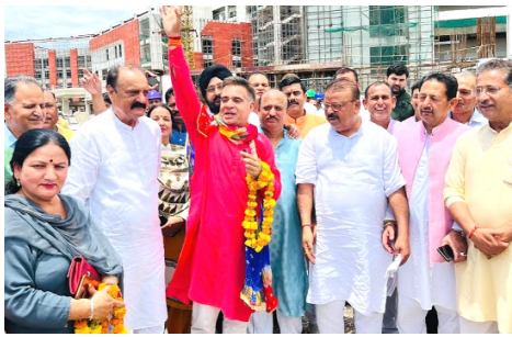
Narendra Modi for his untiring efforts in extending all the developmental projects and welfare schemes to this border UT. He said that AIIMS is one of the prestigious health institutes as well as a landmark of development of the Modi government. He said that prior to it, there was no Health Institution of the level of AIIMS and the suffering people had to move outside Jammu and Kashmir for specialized treatment.