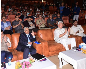
Day. "I pay my homage to the great revolutionaries, freedom

The Lt Governor conveyed his best wishes to the people of Telangana on the Statehood