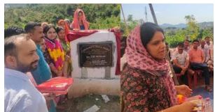
will help to bring the community together and foster a sense of unity.

The Community Halls will be a valuable asset and residents of the area can organize social gatherings, festivals and meetings over there. She was optimistic that the Halls will be used for various activities that