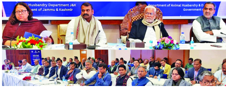
Consultative Committee were also deliberated on various aspects of "Strengthening of Veterinary Services

SRINAGAR, JUNE 02: Union Minister of Fisheries, Animal Husbandry and Dairying, Shri Parshottam Rupala chaired the Inter-Session Meeting of the Consultative Committee attached to his Ministry in Srinagar today. Dr. Sanjeev Kumar Balyan, the Minister of State for Fisheries, Animal Husbandry and Dairying, Dr L.Murugan, the Minister of State for Fisheries, Animal Husbandry and Dairying, Members of Parliament and members of the Parliament