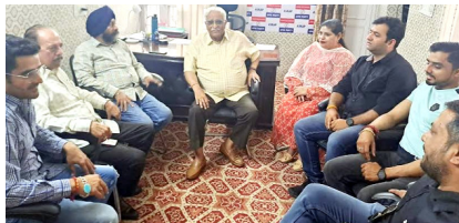
put forth to further the developmental agenda, social security scheme, and public outreach programme to strengthen the party roots across Jammu as well as in the region.

The meeting was held in the Apni Party office at Gandhi Nagar where the party leaders discussed ways and means to further accelerate the growth of AP and to identify the burning public issues which need to be highlighted. The party leaders held threaded discussion regarding party activities, and suggestions were