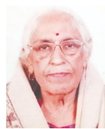
Karan Singh besides other Trustees of Dharmarth Trust have personally

He said that Hon'ble Chairman, Trustee, Dr