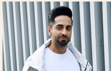
Ayushmann Khurrana to play the cricketer's role in the biopic. According to reports, the film will go on floors by the year-end. Interestingly it is being reported that Superstar