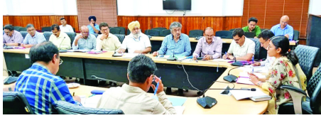
under BDC, 363 under DDC and 2828 are under PRI component.

The Deputy Commissioner was informed that of the total 3646 approved works, 202 are under UT component, 253