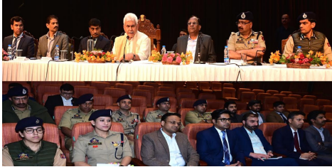
Credit of successful conduct of G20 meeting must go to the team of officials, which worked hard on the ground. The entire Civil and Police administration had shown excellent coordination. The transformative work done by officials shows that J&K UT is now fully prepared to host international-level events, said the Lt Governor.