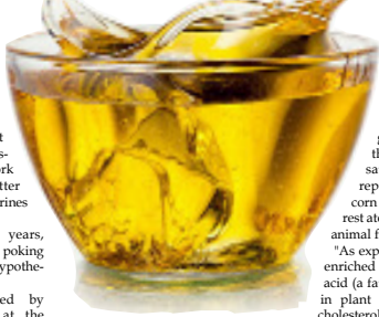
type of experiment -- generally consid-

ered highly reliable -- in which people are randomly divided into