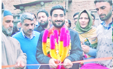
Classroom complex at the High School.

The DC also unveiled the work regarding the Additional