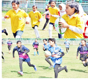
The championship was to promote rugby in the region and provide a platform for aspiring players to showcase their talent.

Secretary said that the popularity of yoga has been on the rise in recent years, and the success of this event has encouraged us to plan more such events in future, creating a healthier and happier community besides helping spread the benefits of this ancient sport to a wider audience, she concluded. Meanwhile the 15th J&K UT Level Rugby Tournament was organized by the J&K Rugby Association in collaboration with the J&K Sports Council. The main aim of