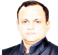
including all Congressmen know well that Rahul Gandhi stands nowhere in front of PM Narendra Modi although they are avoiding to say this fact in public for their vulnerability as many Congressmen had to face ouster for speaking the truth about their leader's caliber.

In a statement given to Media persons, he said that Rahul Gandhi, or any other opposition leader are no match to PM Narendra Modi and it is staunch reality that BJP will come to power once again. He said that deep in heart every opposition leader