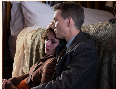
seen holding a copy of the Bhagwad Geeta in one hand."

As per social media reports, a scene in the movie shows a woman making a man read Bhagavad Gita aloud while indulging in sexual intercourse. She is