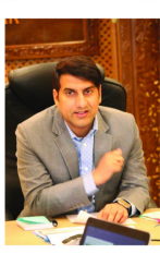
JNEWSSERVICE SRINAGAR, JULY 21

Accordingly, as per the DM order "Whereas pos-