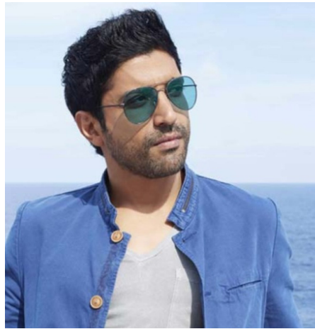
following the lineage of 'Dil Chahta Hai' and 'Zindagi Na Milegi Dobara'.

He announced the film in 2021. The film promises to be another tale of friendship