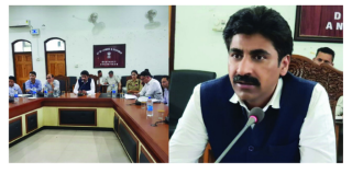
ANANTNAG, JULY 21