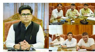
JNEWSSERVICE BANDIPORA, JULY 21