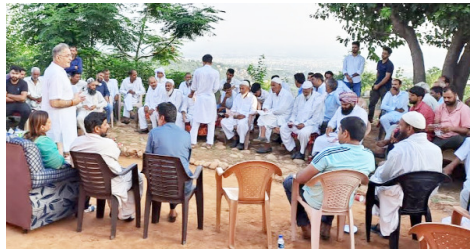
J I NEWS SERVICE

HOLDS MEETING WITH MEMBERS OF MUSLIM BROTHERS; SAYS BJP GARNERING SUPPORT FROM ALL SECTIONS OF SOCIETY