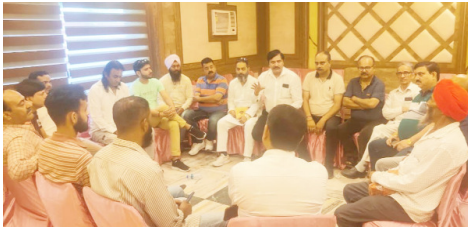
J I NEWS SERVICE