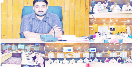
National Cooperative Database under phase I and phase II in the district. Instructions were given to all line departments to work in complete synergy for smooth conver-

The DC emphasised on timely adoption of model bylaws by all primary agriculture credit societies (PACS) to make them economic generation resources. He also directed for timely updating of data on the