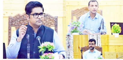
to keep ready all the necessary arrangements including seating arrangements, PA system, uninterrupted power supply, drinking water, Medicare facilities, cleanliness and