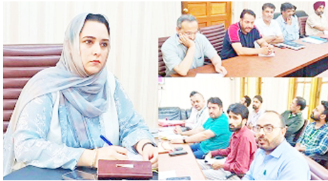
Multipurpose Primary Agricultural Cooperative Society (PACS) and Dairy/Fishery Primary Cooperative Societies covering all panchayat segments and villages in the district. During the meeting, it was informed that