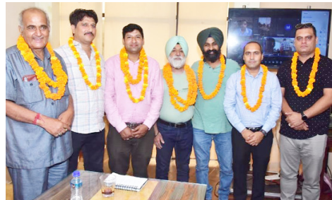
J I NEWS SERVICE