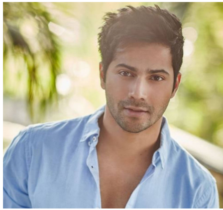
don't think he thought he can do that. But with partners like Amazon, it became much easier," he said in the same interview.

Varun further added how the OTT release would help Bawaal. "The whole idea was to pitch this film on a global level, our producer Sajid Nadiadwala had that vision. Him releasing it himself, I