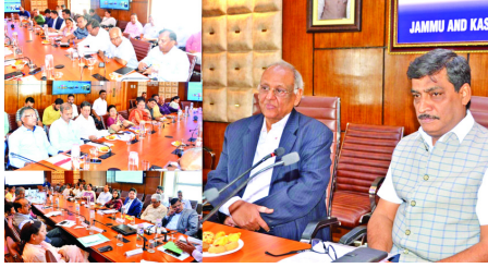
JAMMU AND KASHMIR