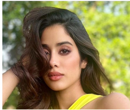
Bhardwaj's Kuttye. He has two films in pipeline: The Lady Killer with Bhumi Pednekar and Meri Patni Ka Remake with Bhumi and Raku Preet Singh. The release dates of the films are awaited. Janhvi and Varun are promoting Bawaal

towards the window, which had a window shield in order to avoid the cameras. Varun Dhawan was in a printed blue shirt and was accompanied by wife-designer Natasha Dalal. She was in a white crop top and black pants. More about Arjun Kapoor On Sunday, Arjun had also shared a few pictures of him posing in his balcony. He had captioned them, "Just gotta be Grateful sometimes Sunday musings." Meanwhile, Arjun's girlfriend Malaika Arora is on a vacation with friends in Baku. She has been sharing several stunning pictures of herself from the Azerbaijan capital. Arjun was last seen in Aasmaan