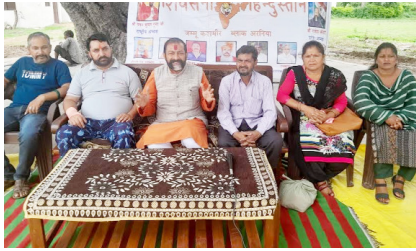
JJ NEWS SERVICE

DRUG AND NARCOTICS PEDDLING AIMS AT CORRUPTING YOUNG MINDS AND PROMOTE GROWTH OF HYBRID TERRORISM