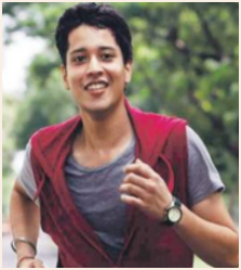
learned so much on the way. Generally even for a classic people celebrate their 10 years

Talking about the film completing 13 years of its release, Rajat shared, "It always feels very special, every year. Udaan has been a very special film for a lot of people and it definitely will be the most special for Vikram (Motwane) and I. We both started our journeys together with this film and