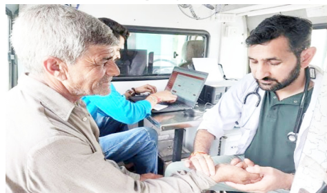
Ji News Service

BANI, JUL 16: A free medical camp was organized in Panchayat Roulka, Tehsil Bani, District Kathua, through the collaborative efforts of Seva Bharti (NGO) and Shira (NGO). The camp aimed to provide healthcare services to the