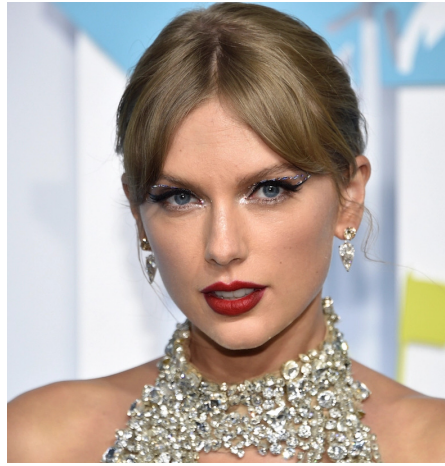
entertainment industry remains undeniable.

Next on the tour schedule is Denver, Colorado, where Swift will captivate audiences with her performances on Friday, July 14, and Saturday, July 15. As Swift continues to captivate fans around the world, her impact on the economy and the