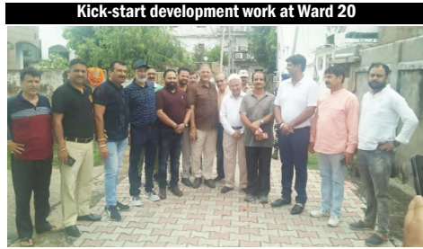
Kick-start development work at Ward 20