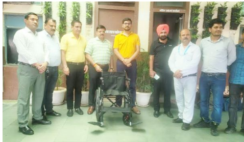
JJ NEWS SERVICE

JAMMU, JUL 13: Chamber of Commerce & Industry Jammu welcomes the Yatries coming from different States/Cities of the