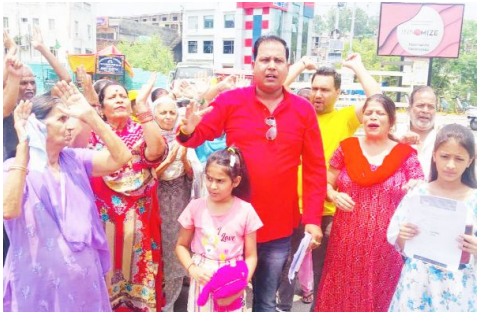
JJ NEWS SERVICE