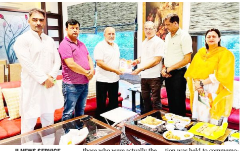
JJ NEWS SERVICE

Restrictions right, fully justified; strongly condemns killing of a BJP leader in Patna