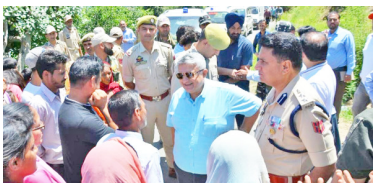
Bike Rally in Chiralla to promote tourism potential destinations in the area.

The DC and SSP accepted the invitation of locals for their participation in Dangal (Local Wrestling) at picturesque Jantroon Dhaar. The DC urged locals to start provision of Homestays in the area to attract the tourists. He asked the people to enjoy and