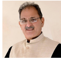
being convened by the Congress next week in Bengaluru. Leaders of 24 non-BJP parties have been invited for the meet on June 17 and 18, the first edition of which saw the participation of 15 parties. In a statement issued to

It is pertinent to mention that the opposition is grouping to take on the BJP in the next Lok Sabha polls. It is set to expand with more parties joining in at the second unity meeting