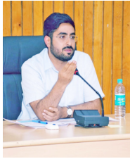
work on clock tower Budgam, beautification of park near clock tower, works related to inner roads within bus adda, works related to landscaping of Humhama-Budgam road and Budgam town. It also reviewed status of

The meeting held threadbare discussions on the agenda points of the meeting viz. Block wise Functional Household Tap Coverage (FHTC), block wise review of number of FHTCs added during the last two months under Jal Jeevan mission in the district, status of all the works under District Capex plan 2023-2024, beautification of Humhama-Budgam road and Budgam town. It also reviewed status of