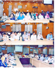
status of works at Badipora, identified during block diwas in the area, plan for initiation of works during follow up of block diwas at Kandoura. The chair also took status of works at Behram cave Beerwah,

macadamization of Mirgund - old bus adda road, panchayat wise status of play fields, progress under recruitment of Anganwadi sahayikas/ sanginies pertaining to ICDS, review of status of telecom network in Doodpathr & Youssang, plan for digitization of backlog mutations and status of in-situ promotions of eligible employees.