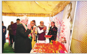
JJ NEWS DESK JAMMU, JAN 30

Lieutenant Governor Manoj Sinha today paid tributes to the Father of the Nation Mahatma Gandhi on his punyatithi. Speaking at an event organized by Gandhi Global Family J&K, the Lt Governor said, Babu's life and teachings continue to guide the inter-dependent world in the 21st century.