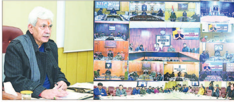
JJ NEWS DESK JAMMU, JAN 30

Lieutenant Governor Manoj Sinha interacted with the people and heard their grievances during 'LG's Mulaqaat- Live Public Grievance Hearing' at Civil Secretariat. The Lt Governor appraised the steps taken on the grievances of the applicants by the concerned Administrative Secretaries, Deputy Commissioners and other senior officers.