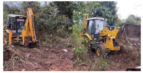
men and machinery on a mission and retrieve the State/ Kahcharie and Roshni land in the district.

It is worth mentioning that Kathua Administration has deployed the