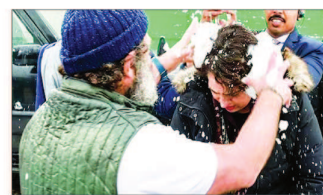
JJ NEWS DESK SRINAGAR, JAN 30

Congress leaders Rahul Gandhi and his sister Priyanka Gandhi Vadra enjoyed the snowfall in Srinagar on Monday. Kashmir witnessed the season's first major snowfall that started Sunday evening and is still continuing. The brother and sister were seen enjoying the snow