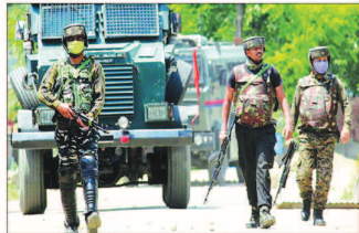
JJ NEWS DESK SRINAGAR, JAN 30

Security forces destroyed a hideout of Lashkar-e-Taiba and arrested four associates of the group in Jammu and Kashmir's Awantipora sub district, police said on Monday. Police said the militant hideout was busted and destroyed at Hafoo Nageenpora forests of Awantipora sub district. Police said on a specific input a joint operation was launched by Army and CRPF at Hafoo Nageenpora forests. "During search, a hideout used by terrorists was