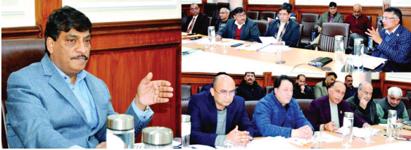
Two way traffic on the Highway to commence by 15th March