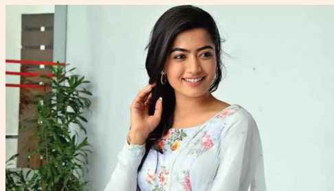
fat. If I talk too much, she's too cringe. If I don't talk at all, oh, it's attitude. I'm like people will have a problem with me breathing and not breathing as well. So

Talking to Prema the Journalist on her YouTube channel, Rashmika said, "People are having a problem with my body. If I work out too much, I look like a man. If I don't work out too much, I'm too