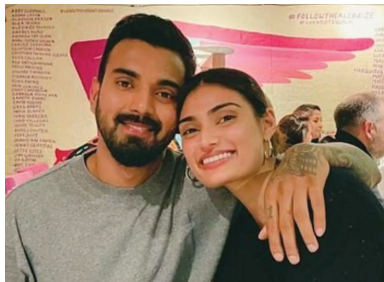
night which took place at Athiya's father-actor Suniel Shetty's farmhouse in Khandala. Athiya and KL Rahul had been dating for quite a few years. They, however, never spoke about each other publicly, but kept dropping hints on social

The video also had a blurred Rahul shaking his leg with the guests. Athiya makes a blink-and-miss appearance seemingly in a white outfit. Several other videos also featured songs like Salman Khan's Mujhse Shaadi Karogi and Hero No 1 song Sona Kitna Sona Hai, which was a part of the playlist of the sangeet