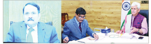
JAMMU, JAN 22

The Administrative Council (AC) which met here under the chairmanship of the Lieutenant Governor, Manoj Sinha gave its assent for authorizing Revenue Department to move an amendment in Section 21 and Section 29-A of Agrarian Reforms Act, 1976