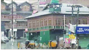
SRINAGAR, JAN 22

Inclement weather continued on Sunday with Light to moderate snowfall, Rain occurred at many places even as the Meteorological office forecast generally Cloudy with light Snow/rain over scattered places of the J&K during the next 24 hours.