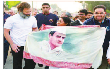
JAMMU, JAN 22

Congress leader Rahul Gandhi led Bharat Jodo Yatra after a day long break, resumed on Sunday morning from Hiranagar belt of