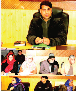
Immunization programme and Surveillance activities to achieve the target in stipulated time. He urged the Officers to adopt a multipronged inter-

ing. During the meeting, a three-hour deliberations were held with regard to implementation of a road map formulated by the Government for Measles, Rubella Elimination from the Country by 2023. An Action Plan for achieving strategic objectives for Measles & Rubella Elimination also came under discussion. On the occasion, the DC urged upon the senior Health functionaries of the District to take all possible measures with focused attention in unison with ICDS and Education Departments to identify the dropout cases in District besides immunization process for Measles, Rubella Elimination in the District. The DC further stressed on better management of Universal