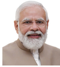
NARENDRA MODI, PRIME MINISTER OF INDIA