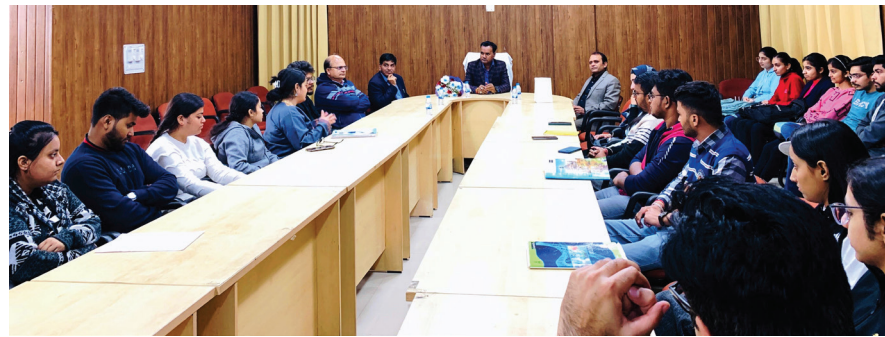
JJ NEWS SERVICE JAMMU, DECEMBER 7