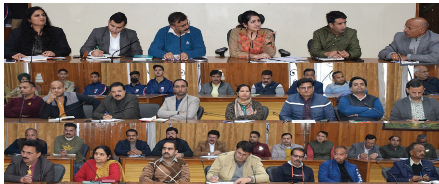
JJ NEWS SERVICE UDHAMPUR, DECEMBER 7