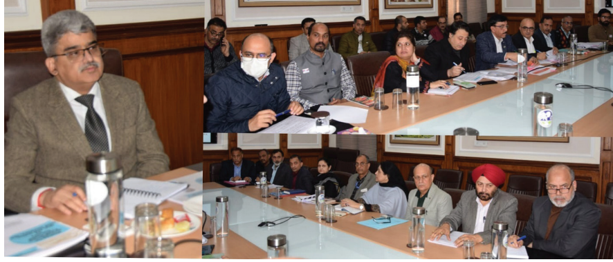
JJ NEWS SERVICE JAMMU, DECEMBER 7

Chief Secretary, Atal Dulloo today while reviewing the health care scenario of the UT impressed upon the concerned authorities to take meaningful steps for full operationalization of all the major health facilities across the UT.