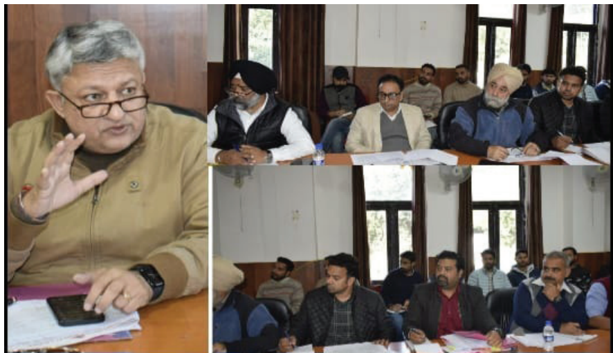
JJ NEWS SERVICE REASI, DECEMBER 7