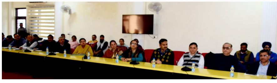
Commissioner Secretary emphasized the scheme's broader benefits, including the reduction of electricity bills for citizens, employment

generation, and the promotion of clean energy. Bhagat concluded by reiterating the commitment to install 100 MW of rooftop solar power in approximately 50,000 households in Jammu city. The scheme, with its attractive features and amid rising power tariffs, stands as a beacon of sustainable development for the region, he added.