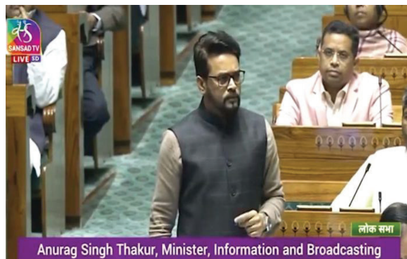
Anurag Singh Thakur, Minister, Information and Broadcasting

Intervening in the debate on the Jammu and