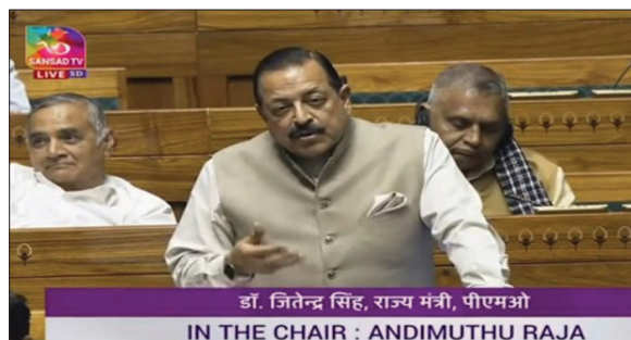
Dr. Jitendra Singh, राज्य मंत्री, पीएमओ IN THE CHAIR : ANDIMUTHU RAJA

Intervening in the discussion on the Jammu and Kashmir Reservation (Amendment) Bill and the Jammu and Kashmir Reorganisation (Amendment) Bill, the minister of state in the prime minister's office (PMO) said "whenever the