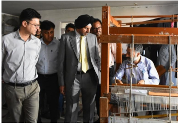
other staff members of Handloom Department, various Artisans, Weavers, & members of Cooperative Societies also attended the event.