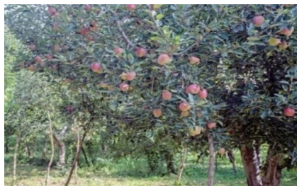
J NEWS SERVICE

Srinagar, Aug. 06: In a bid to boost and explore more tourism potential in the valley, the Tourism department in Kashmir has shortlisted around 300 new spots that will be promoted as tourist destinations in coming times,