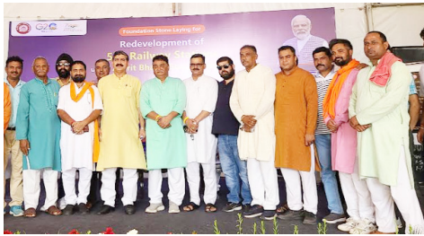
JI NEWS SERVICE