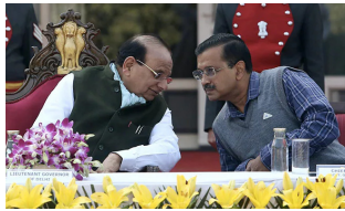
fighting the bill tooth and nail.

NEW DELHI : The bill that would replace the Delhi Services ordinance - giving the Centre control over the postings and transfers of Delhi bureaucrats - contains three key changes one of which offers some respite to the Delhi assembly in terms of legislation. A key portion that prevented the assembly from creating laws on "State Public Services and State Public Service Commission" has been removed. The power granted to the Lieutenant Governor to appoint chiefs of all bodies, boards and corporations has also been curbed. He will now deal only with bodies set up through an act of parliament.