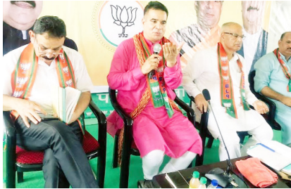
J I NEWS SERVICE