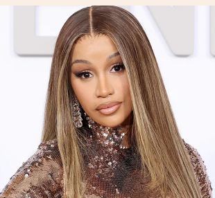
team jumped into the audience to intervene. Some videos also appear to show the mic making contact with a different member

Days after rapper Cardi B hurled a mic at a member of her audience for throwing a drink at her, US police has said that they had begun a battery investigation. Several videos on social media platforms show Cardi B performing near the front of a stage in Las Vegas when someone splashed a drink on her. What happened at Cardi B's concert As she sang, someone from the crowd, apparently a woman, threw liquid from her cup in the rapper's direction. Visibly shocked but only for a second, Cardi B hurled her microphone at the person while mouthing cursing words. Members of her security