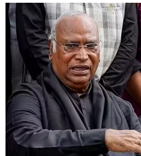
any circumstances," he said.

"The violence being spread in the name of religion in 21st-century India is a blow to the foundation of our civilization - equality of all religions. This cannot be tolerated under