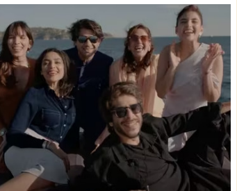
Instagram, "The wedding season has officially begun. Watch your favourite wedding planners back into action in Made In Heaven Season 2. Trailer out now!" About Made In Heaven Made In Heaven, created by Zoya Akhtar and Reema Kagti, is regarded as one of the most Indian popular shows on OTT. The Prime Video show is an anthology series headlined by Arjun Mathur (Karan Mehra) and Sobhita Dhulipala (Tara Khanna), who play wedding planners. Made In Heaven portrays today's India as a blend of old and new, where tradition and modern aspirations are at loggerheads. The show and protagonists' narratives play out against the backdrop of lavish and expensive weddings. For the last couple of weeks, Zoya and team Made In Heaven have been sharing old clips from season one of the show to keep the viewers engaged, and also addressed the delay in the release of season 2. The first season of the show had released in 2019. challenging as she navigates her personal life with Adil and Faiza while planning lavish weddings," the actor said in a statement.

prospective clients also do not have it easy. From abusive relationships and secret affairs to commitment issues, Made In Heaven 2 trailer teases what all will come, when the series drops next week. Produced by Excel Media and Entertainment and Tiger Baby, the International Emmy nominated series is directed by Alankrita Shrivastava, Neeraj Ghaywan, Nitya Mehra, Reema Kagti and Zoya Akhtar. Sharing the trailer on Instagram, filmmaker-producer Farhan Akhtar wrote on