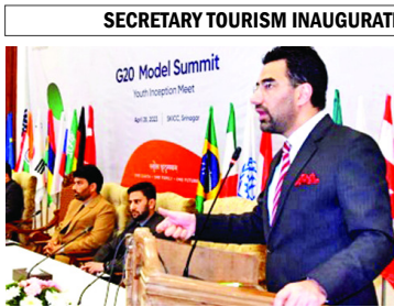
Secretary Tourism inaugurates function

The Summit was organised by Directorate of Tourism Kashmir and held as a replica of original 3rd Tourism Working Group Meet to be held at SKICC