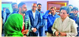
steps are taken to improve the welfare of women of Baramulla. The Chairperson emphasised that women need to be confident in empowering themselves as they are the ones who shape the society. She exhorted upon the officers to launch massive awareness drives across the district so that the women can understand their rights. During the meeting, she also highlighted the role of women in the lives of people and their contribution towards society. Meanwhile, the Chairperson also appreciated the efforts of the district administration for organizing career counselling for girl students at the very opportune time and hoped that more such programmes are held for each and every student at Higher Secondary level so that they are able to make better career choices at the initial stage of their lives.

Speaking on the occasion, the Chairperson said that various initiatives have been launched with an aim to uplift women and bring in gender sensitivity especially by reaching out to women who have been vic-