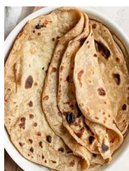
The right way to consume leftover rotis

one? "Wheat is one of the world's most common and controversial cereal. It is a rich source of fibre, vitamins, minerals and antioxidants. It is a good source of carbohydrates and an energy food. Whole wheat flour ranks moderate on glycaemic index and high on glycaemic load, but it is also a good source of insoluble fibre which can be effective in reducing the postprandial blood response. Researchers suggest that repeated cycle of cooking and freezing increases the resistant starch which may potentially increase the healthy gut microbiota. Grains high in resistant starch improve human health and possess beneficial effects for diabetics. Further studies need to be carried to support the health benefits of stale rotis for diabetics," says Nutritionist Priya Palan in an email interview with HT Digital.