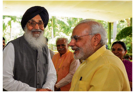
After the NDA government came to power at the Centre in 2014, he once again provided valuable insights based on his rich governmental experience. He strongly supported several reforms, including the historic GST.

There is an anecdote I can never forget. After taking oath as CM, Badal Sahab told me that we would go to Amritsar together, where we would halt at night and the next day we would pray and have langar. I was in my room at a guest house but, when he got to know of this, he came there and began to pick up my luggage. I asked him why he was doing this, to which he told me that I would have to come with him to the room meant for the CM and stay there only. I kept telling him that there was no need to do this, but he insisted. Eventually, this is exactly what happened and Badal Sahab stayed in another room. I will always cherish this gesture of his towards a very ordinary karyakarta like