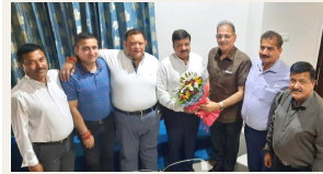
J I NEWS SERVICE