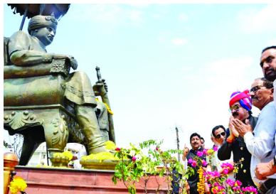
places to lower castes. His contributions to the state & nation are immense, and his legacy continues to inspire generations.