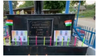
J I NEWS SERVICE

RAJOURI, APR 26: The local population of Lam today organized a Candle March in order to pay tribute to the bravehearts who gave ultimate sacrifice in Poonch terror attack. The locals strongly condemned the attack and displayed their solidarity with the Indian Army. They urged everyone to provide their full fledged support to the armed forces as they are working tirelessly towards development of the locals and protecting us at every front. We are safe only because of them.