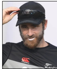
case there is that chance still. "Yeah, absolutely [would take him to India as a mentor]."