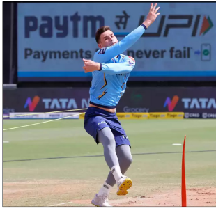
back home in Afghanistan where he is hailed as a teen sensation, the next big thing in country's cricket, second only to Rashid Khan.