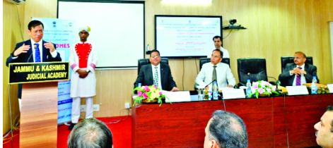
Chief Justice sought synergized efforts by the judicial officers and lawyers towards institutionalization of the mechanism of mediation for larger benefit and satisfaction of the litigant public. He said mediation is a programme which we cannot undertake without the participation of Bar.

He underlined the importance of lawyers stating that they play a dual role in Mediation Process as on one hand they have to persuade their clients for mediation and on the other they have to perform the role of mediator for facilitating amicable settlement of disputes.