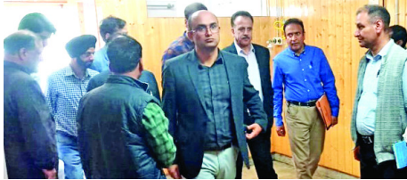
Nursing Home and reviewed ongoing works being executed regarding health care facilities for the G20 summit. He directed the Principal GMC and Medical Superintendent Kashmir Nursing Home to expedite the pending works and make the hospital fully ready in all respects within a fortnight. He also directed the Medical Superintendent to increase the OPD footfalls of the hospital so that the people are benefited at large. Pertinent to mention, Secretary Health and Medical Education has been regularly taking stock of healthcare arrangements for G20 meetings to ensure all requisite facilities available for the visiting dignitaries. The medical staff is being trained and updated regarding healthcare equipment and facilities which will be available during the G20 summit.

Superintendent Kashmir Nursing Home to expedite the pending works and make the hospital fully ready in all respects within a fortnight. He also directed the Medical Superintendent to increase the OPD footfalls of the hospital so that the people are benefited at large. Pertinent to mention, Secretary Health and Medical Education has been regularly taking stock of healthcare arrangements for G20 meetings to ensure all requisite facilities available for the visiting dignitaries. The medical staff is being trained and updated regarding healthcare equipment and facilities which will be available during the G20 summit.