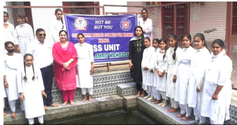
JJ NEWS SERVICE

KATHUA, APR 25: Cleanliness Drive of Water Bodies conducted by NSS Unit of GDC Women Kathua was carried out on 25-04-2023 at adopted village Changanr under the banner of G20 presidency of India. The entire cleanliness drive was conducted under