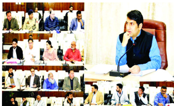
Agriculture Officer, DFO Urban, FCS&CA RTO, Traffic Police. At the outset, the Deputy Commissioner reviewed Action plans proposed by the Sub Committees constituted for Reclaiming & Greening of denuded Hill slopes, IEC activities and Roadside plantation under NCAP in Srinagar District. On the occasion, a three-hour discussion was held on the Action Plans proposed by the concerned Departments. Srinagar aimed to reduce PM10 levels by 2025 to improve Air Quality Index in the District. While reviewing the Action Plan for Reclaiming & Greening of Hills, the Deputy Commissioner was informed that 3 spots have been identified by the Committee which shall be developed through plantation and green cover with visible impact particularly in stone quarry/mining affected areas and barren patches of the mountains. The DC was also apprised that DPR of Rs 2.50 crore for construction of water fountains along Sakidafar-Aali Masjid Road Axis under NCAP to reduce the air pollution in the area.