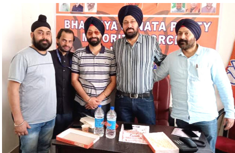
JJ NEWS SERVICE

JAMMU, APR 25: In connection with organising different meetings of workers involving general masses and to form booth