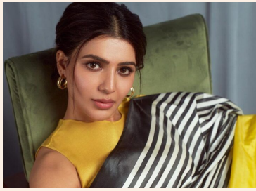
flower was all over my arm. I sort of had a flower tattoo on my

The video featured Samantha travelling in a car. She talked about her allergic reaction to flower ornaments on the sets. She said, "I shot all day without any complaints, and then in the evening, the imprint of the