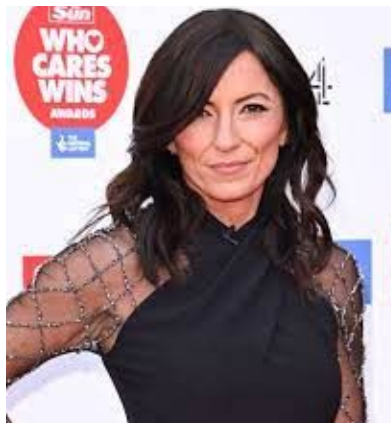
The Romance Retreat will air on ITV1 and ITVX and promises to be an exciting new venture for the beloved television host. Fans of McCall can't wait to see her bring her energy and enthusiasm to this fresh take on the dating show format.

"These are people who have really lived a life and got to a point where maybe they have been single for years or maybe they just got divorced," McCall explained. "I've met people in the last two weeks who, when they talk about coming on the show and I talk to them about their story, start crying as they really want it."