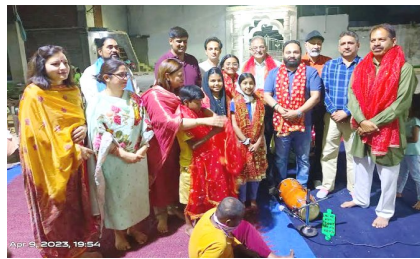
JJ NEWS SERVICE

'Farooq's love towards invaders out of communal tinge'