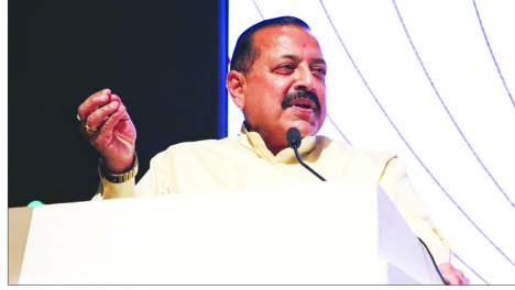
Union Minister Jitendra Singh said more than 2,000 rules and laws were scrapped by the Narendra Modi Government in the past nine years for ease of governance and ease of doing business, according to an official statement issued on Sunday.

He said the three categories in which the awards have been presented, namely innovation in healthcare, transforming people's lives and ethical governance, have always been the priority of the Modi Government.