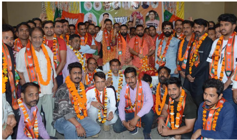
JJ NEWS SERVICE

Morcha committed to act as beacon of light to guide unprivileged sections: Shiv Dev