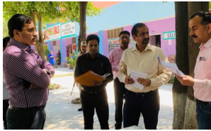
J1 NEWS SERVICE

Calls for concerted efforts to raise awareness, include all eligible voters