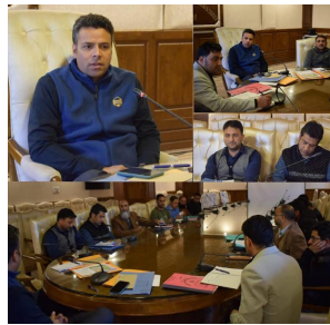
J1 NEWS SERVICE