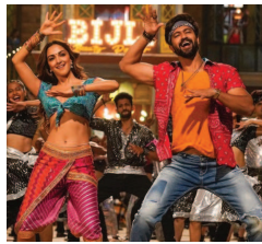
December, only on @disneyplustar!"

Sharing the video, he wrote, "It's time to groove to the most electrifying tune of the season! #Bijli SONG OUT NOW! #GovindaNaamMera streaming from 16th