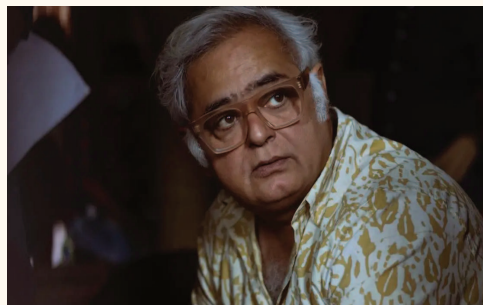
will emerge stronger out of it.

However, filmmaker Hansal Mehta, who has been working in the industry for three decades, is of the opinion that it's a "transitory" phase for Bollywood and the industry