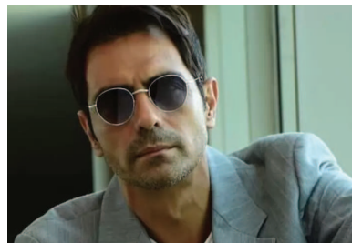
attention towards him.

'Raajneeti' Arjun Rampal in 'Raajneeti' is definitely one of the most iconic roles played by him. Playing the role of a sly and tactful politician is definitely not easy, as Arjun plays the role with zeal and charm even though being a grey-shaded character. As Prithviraj Pratap, the character he played, Rampal definitely grasped all our