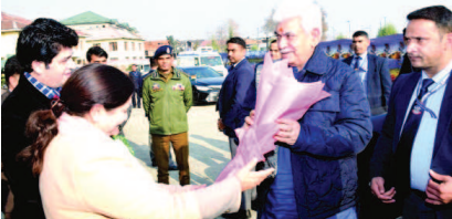
Jl NEWS SERVICE

Education Institutions must ensure that the new learning framework and key concepts as recommended by National Education Policy are incorporated in curriculum: LG